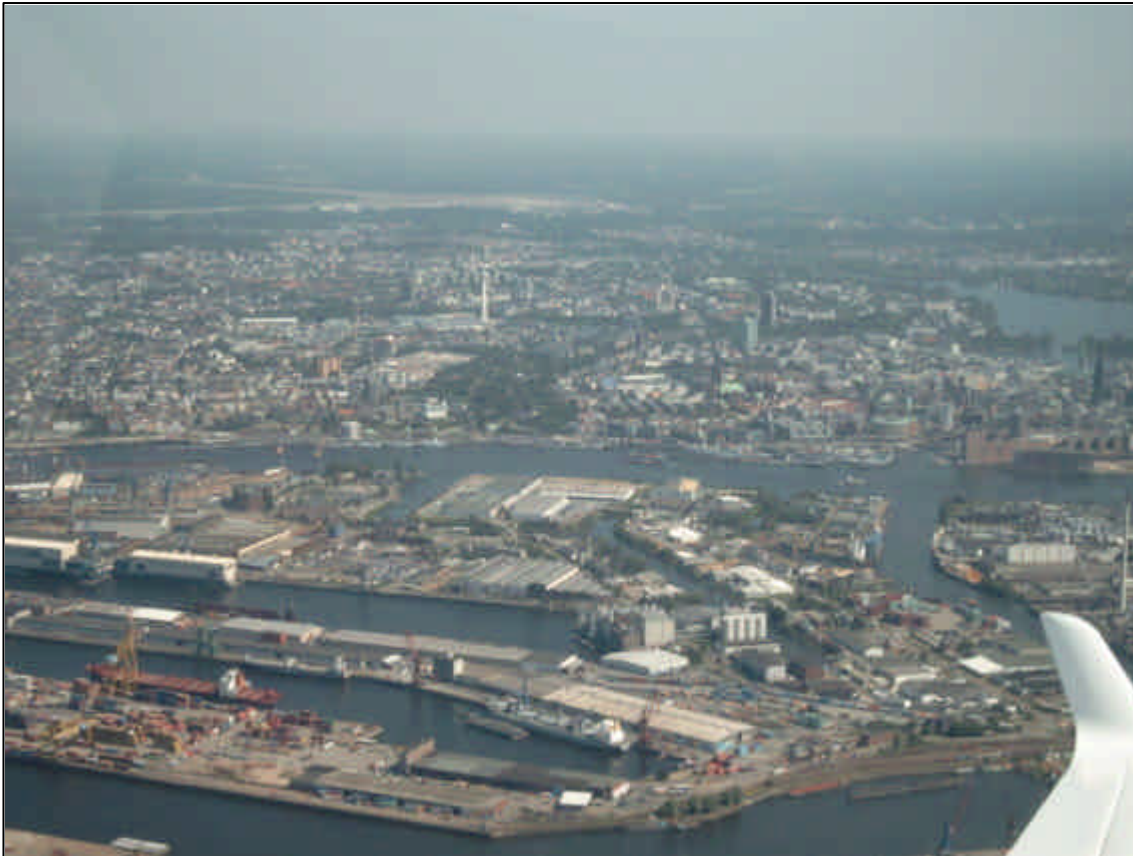
Take-off from Hamburg-Finkenwerder (Airbus) following river Elbe upstream