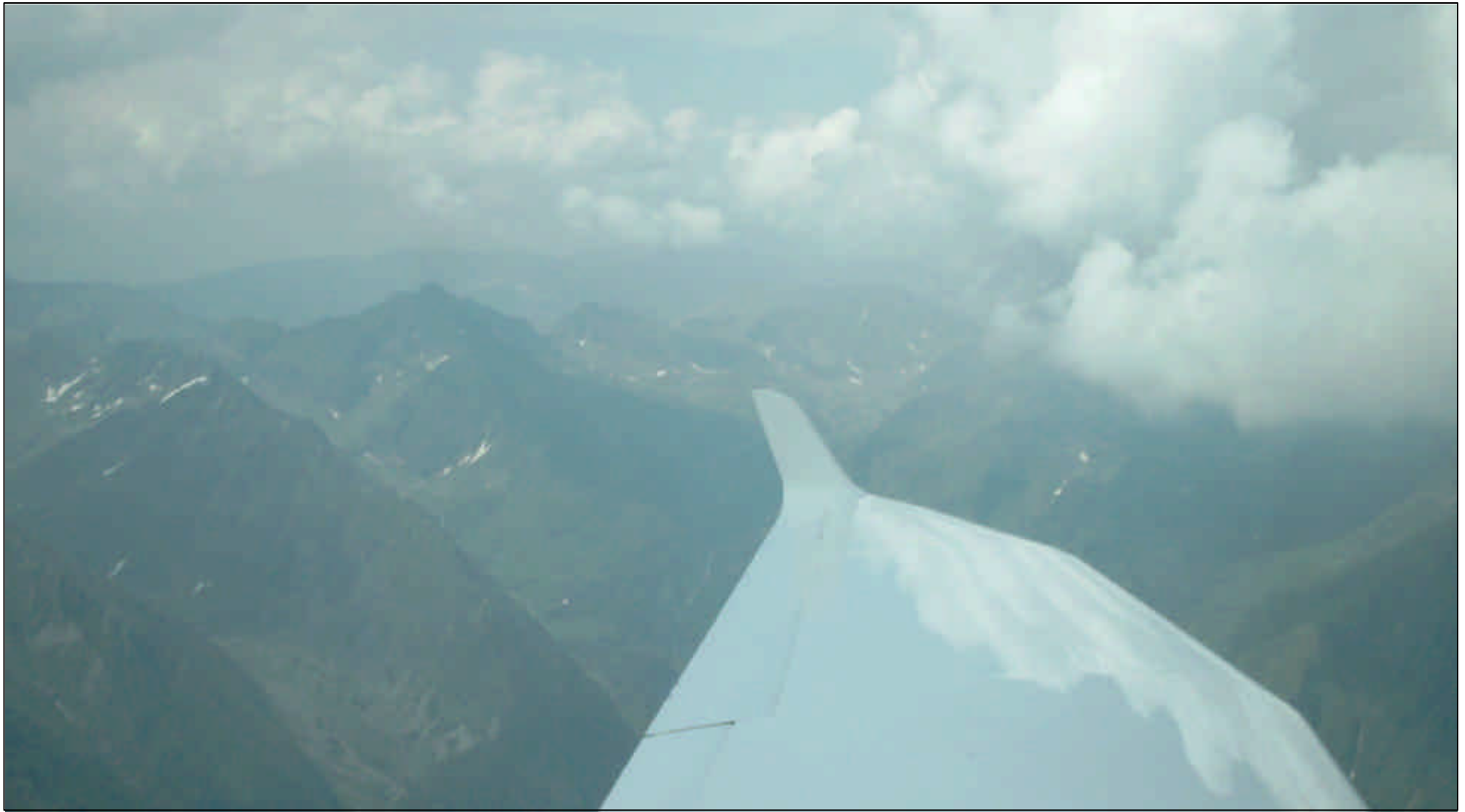
Crossing the Alps (Niedere Tauern) between Klagenfurt and Linz