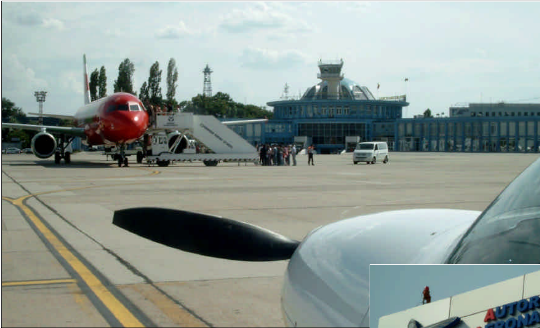
Baneasa airport, Bucharest