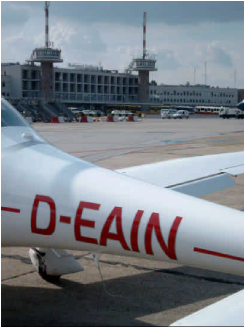
Budapest Ferihegy (main airport)