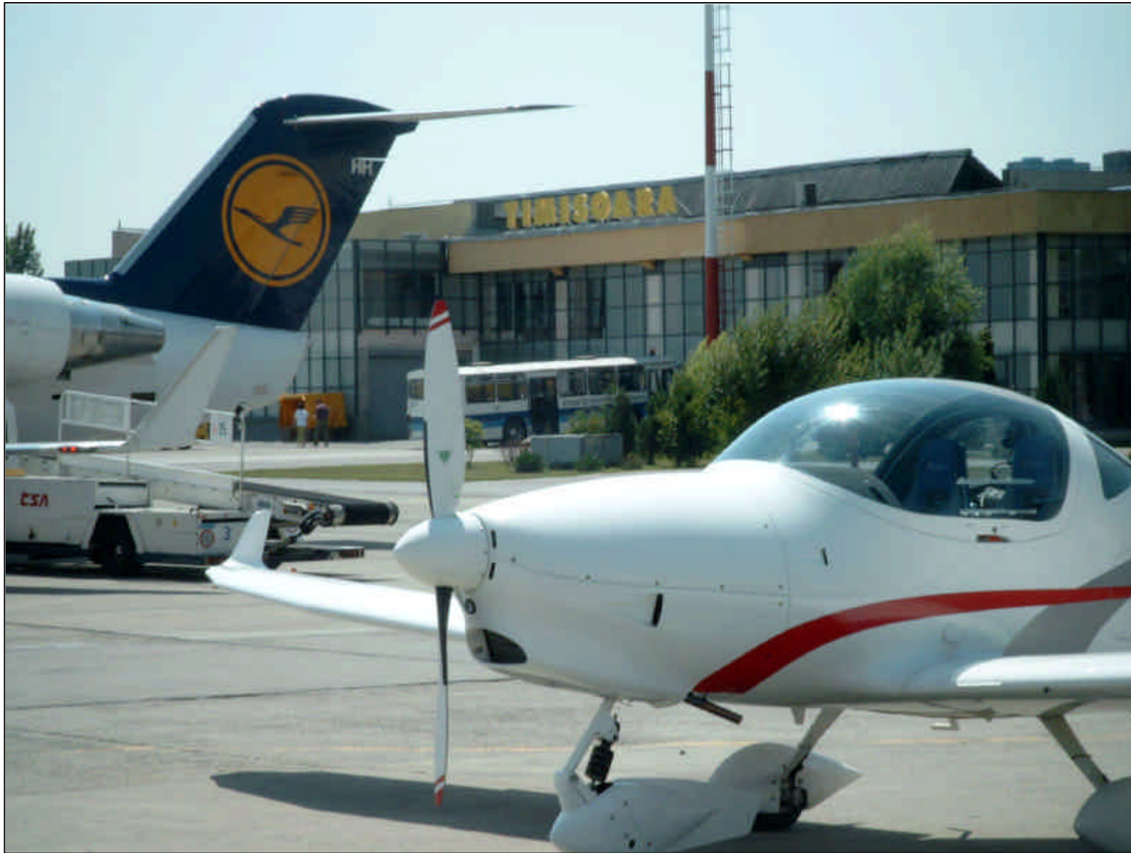
Two aircraft from Germany at Timisoara airport