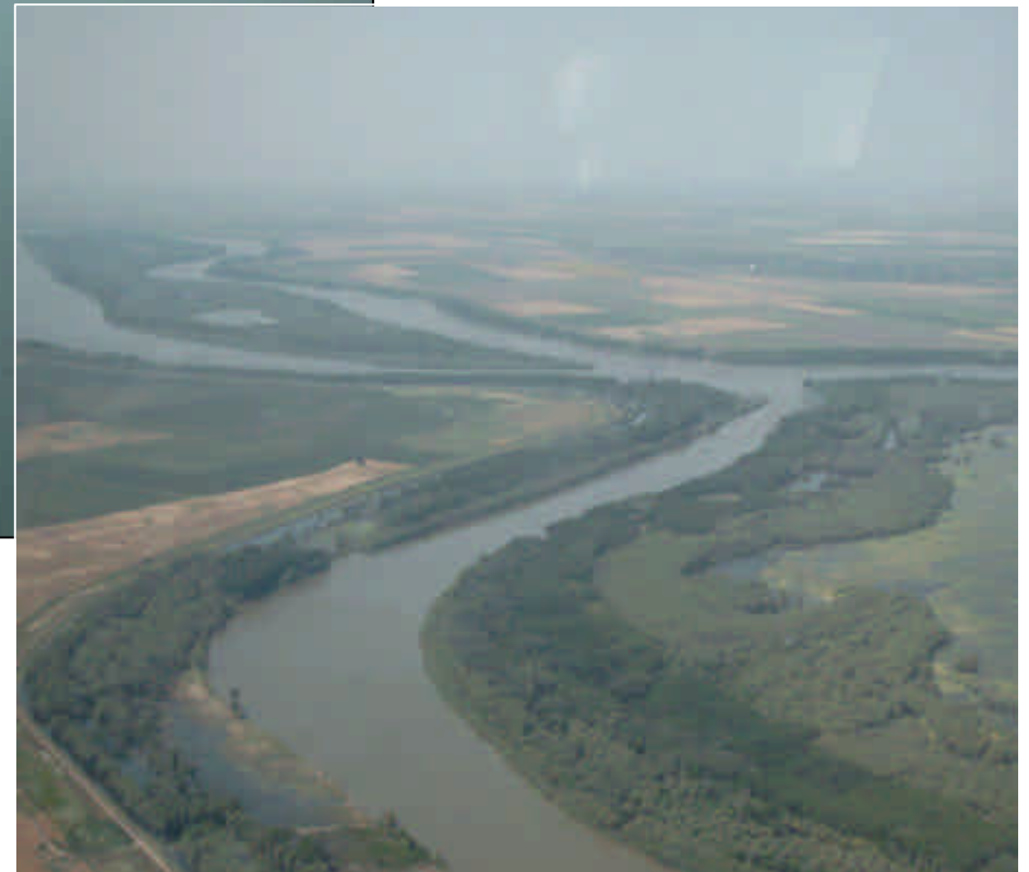
Danube: south of the city Romanu