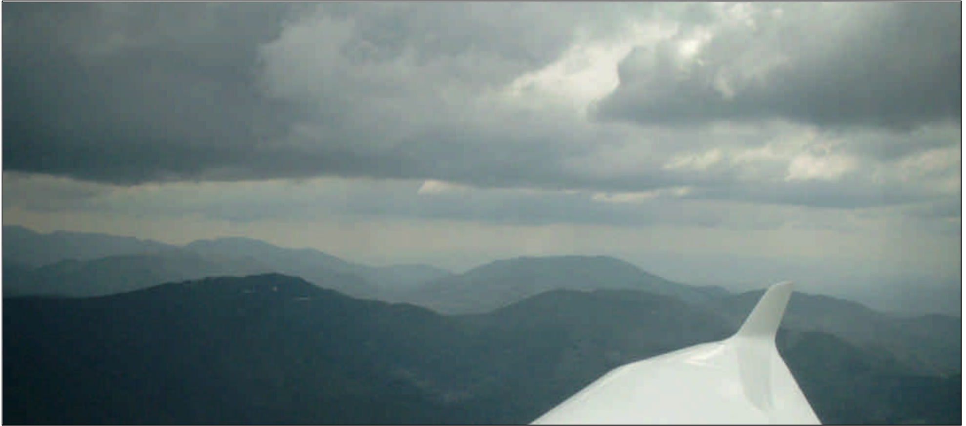
Crossing the southern Carpathians