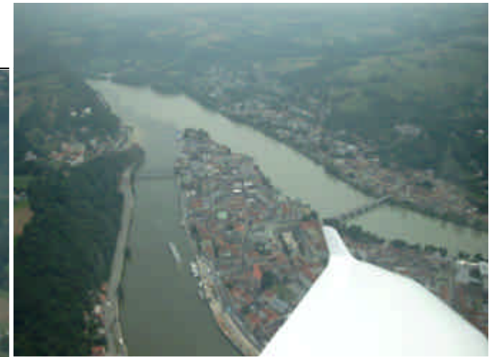
Passau - city of three rivers: Inn, Danube / Donau, Ilz (from left to right)