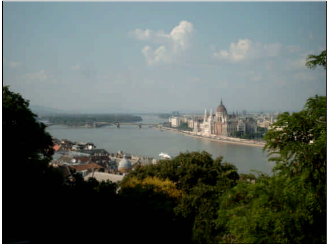
Budapest: Danube and parliament building