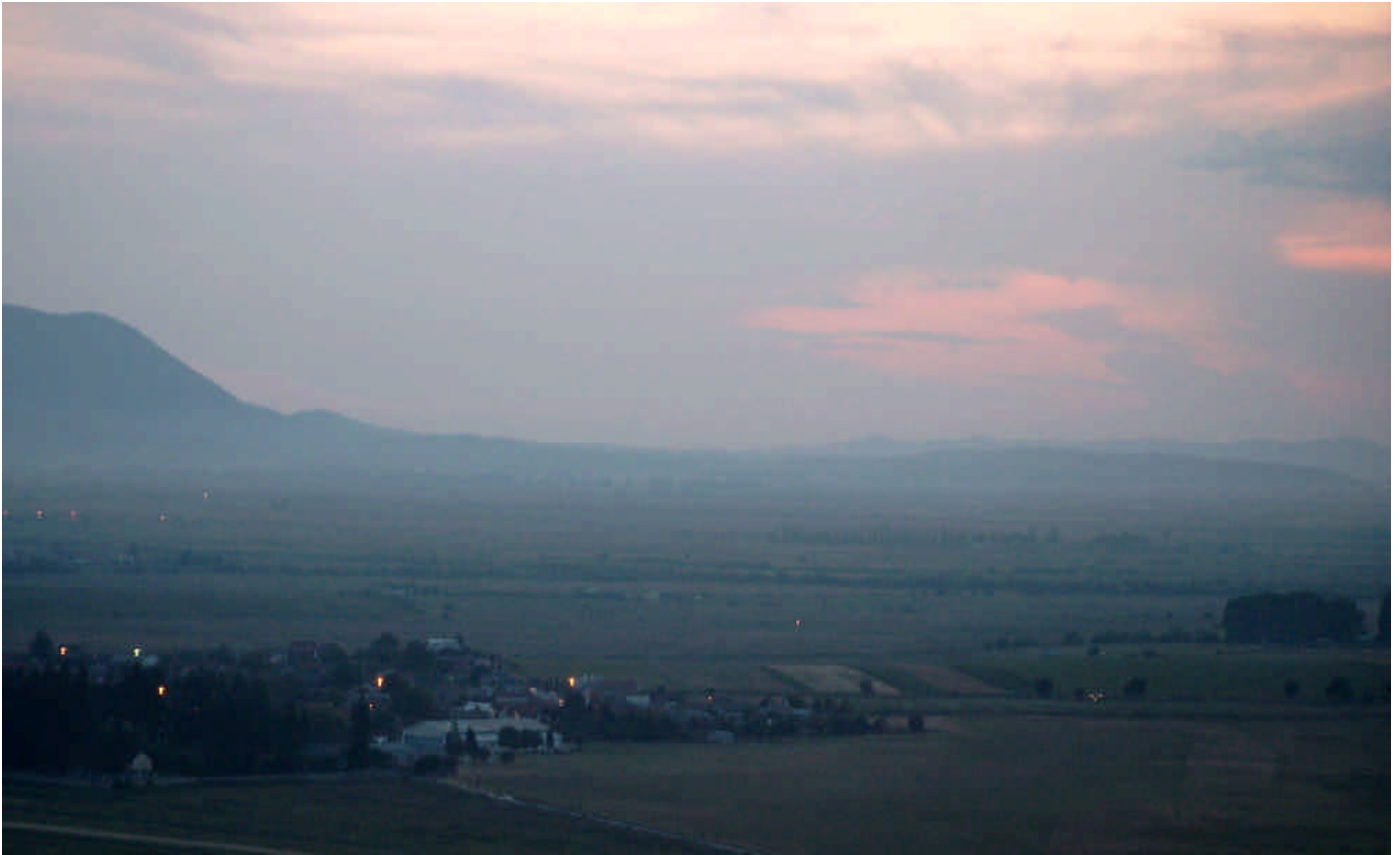
Dusk over Sinpetru (Petersberg) and its airfield near Brasov